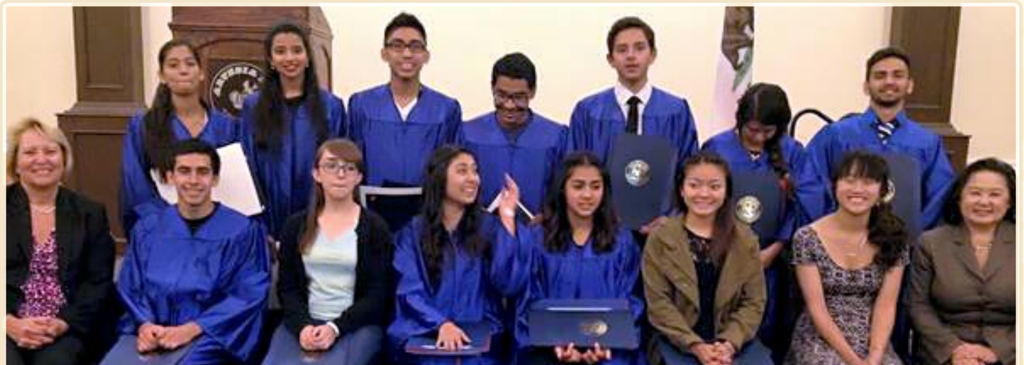
Artesia Chamber of Commerce Scholarship Recipients

Graduating seniors living in the City of Artesia were honored by the City of Artesia at the Artesia Chamber of Commerce on May 21, 2014 at the Artesia D.E.S. Hall. Selected students were provided scholarships by the Artesia Chamber of Commerce. ▶