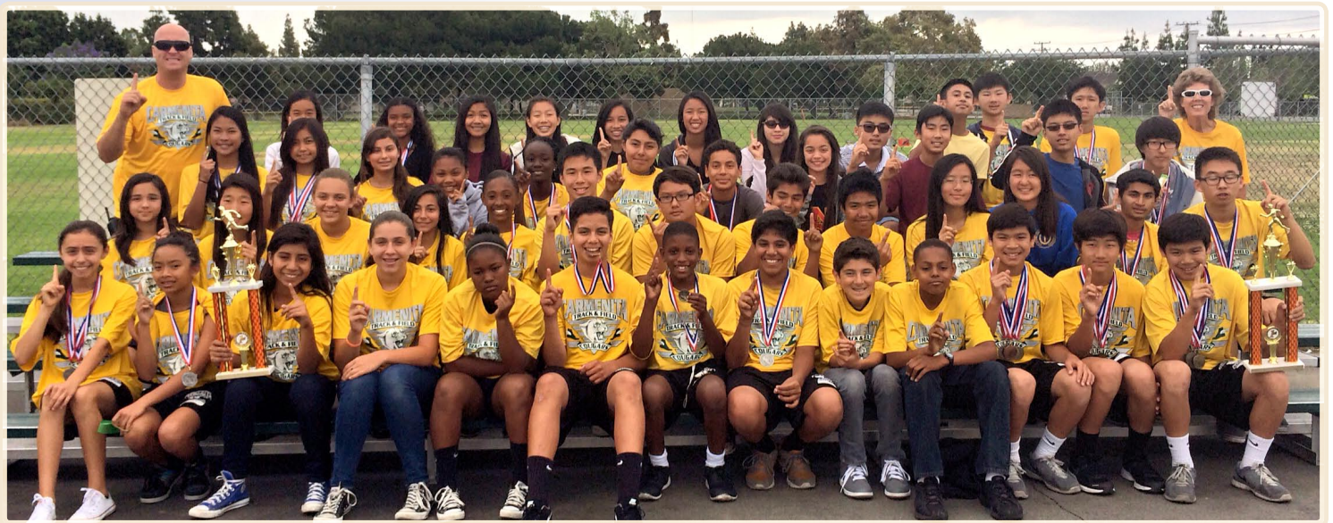
2014 Middle School Track Meet Champions.

Congratulations to the following overall Winning Teams: 7 th Grade Girls – Carmenita MS; 7 th Grade Boys – Carmenita MS; 8 th Grade Girls – Tetzlaff MS; 8 th Grade Boys – Whitney HS; Best Sportsmanship Award – Ross MS; and Overall Champions – Carmenita MS ▶