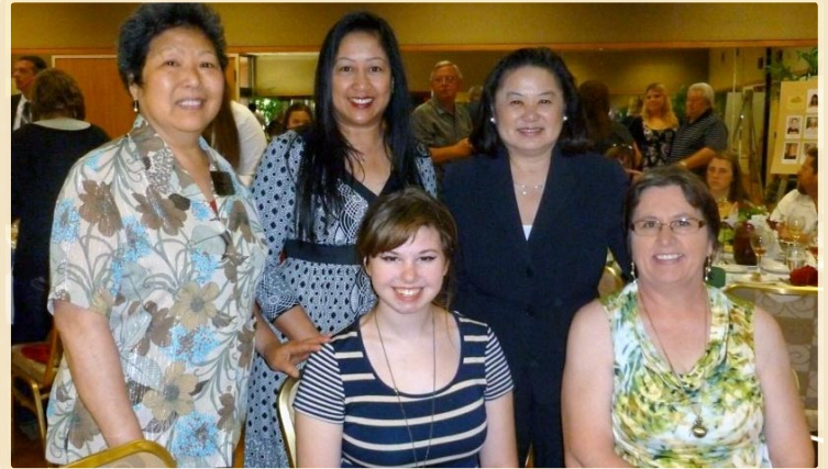
Lakewood Pan American Association Scholarship Winner