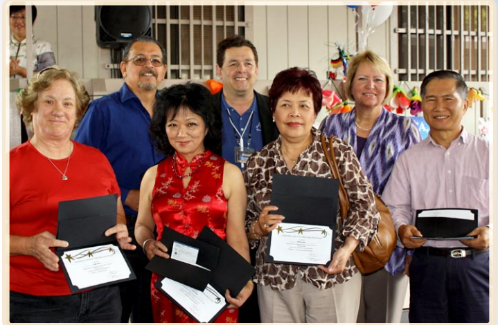
California Council for Adult Education Grant Award Winners

Adult School International Day was awarded a "Making a Difference Award" from California Department of Education in 2013. ▶