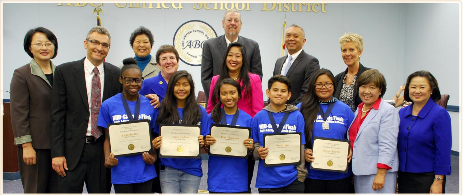
Fedde International Studies Academy History Day State Champions being recognized by the ABCUSD Board of Education