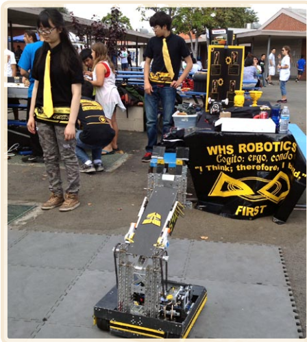
Special exhibit by Whitney HS Robotics Club