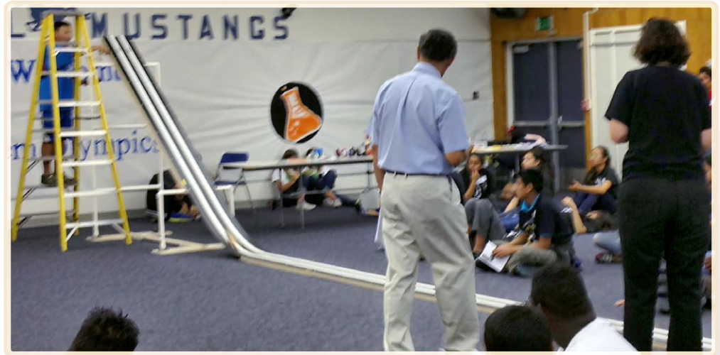
Recycled Dragster Event at the MS STEM Olympics